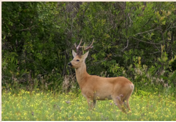
Siberian Roe Deer